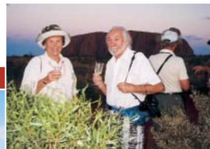
Interhostel participants enjoying Australia

Interhostel provides educational travel programs for participants aged 50 and over. The three week 'Best of Australia' tour was created to provide an overview of Australia from geographical, biological, political and cultural perspectives and to offer a deeper and more interesting experience than participants could achieve on a self-guided or standard tour. The program, under group leader, Peggy Doherty, combined lectures, presentations, site visits and activities in different locations around Australia, including Sydney, Canberra, Alice Springs, Uluru (Ayers Rock), Cairns and the Great Barrier Reef, Brisbane and Moreton Island. This was just one of the wide range of customised, travel learn style programs, including 'special interest' programs provided by ICTE-UQ in 2002.