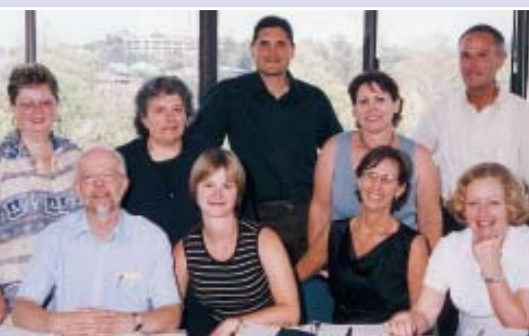
First ICTE-UQ IDLTM participants

The eight participants in ICTE-UQ's first IDLTM program came from New Zealand, Vietnam and different parts of Australia and gathered at ICTE-UQ in November for the first two week, face-to-face component of the program.