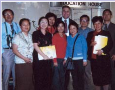
2002 EMTP participants visiting the Queensland Government Department of Education

"I've gained more than I expected – I've learned many new practical techniques in teaching English at primary level – how to work together happily and successfully." Feedback from past EMTP participant