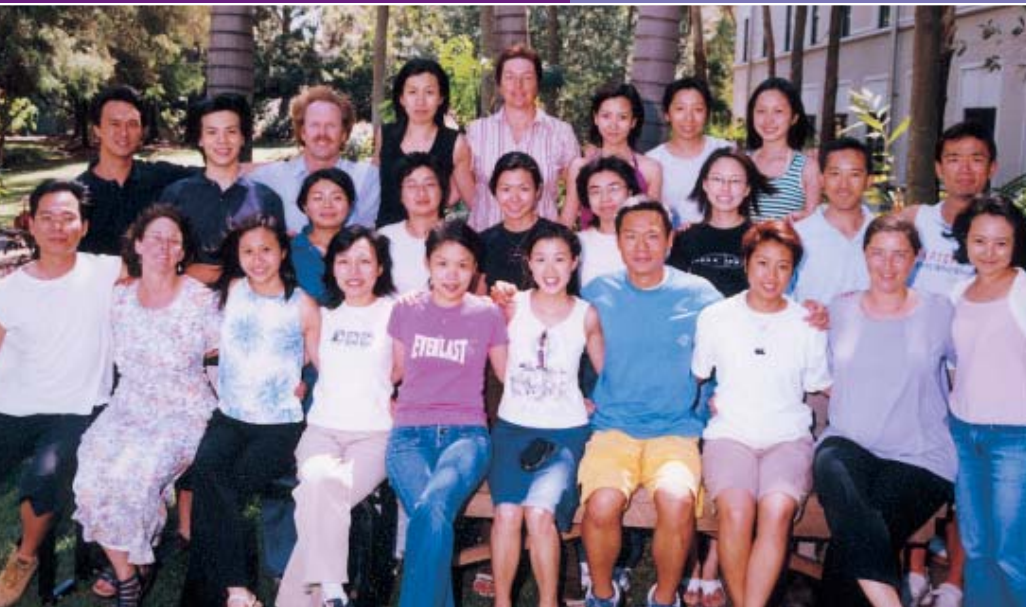
Hong Kong University program participants