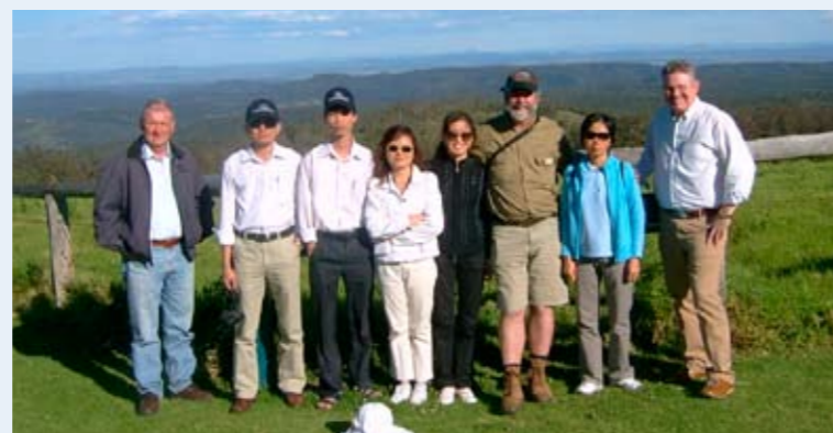
Program participants with NRAVS staff

The program was supported by AusAID through the Australian Leadership Awards Fellowships program and is the result of over three years of close collaboration between the UQ School of Integrative Systems, UNESCO Man and Biosphere program, Hai Phong People's Committee, and the Hanoi National University of Education with the ICTE-UQ ESI division providing program coordination and logistics support.