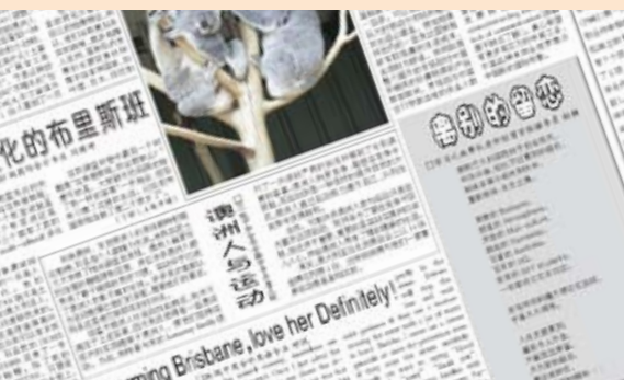
SIFT campus newspaper