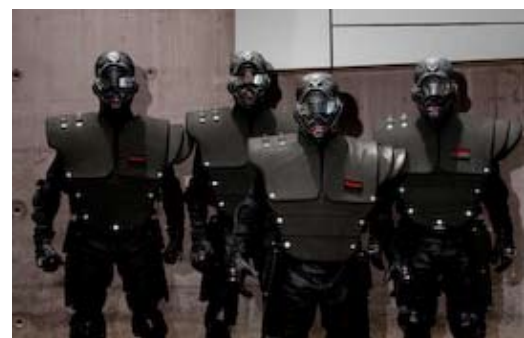
K-9 Robotic Police Officers