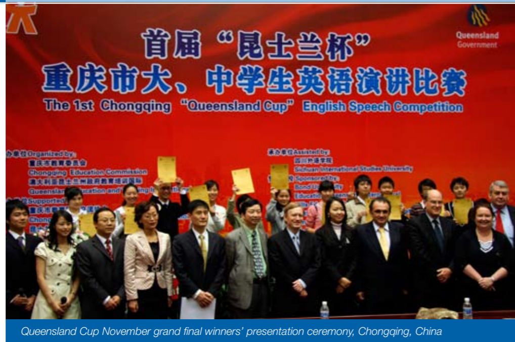
Queensland Cup November grand final winners' presentation ceremony, Chongqing, China

The grand final featured live, on-stage debate on a range of social and political issues facing China. Contemporary topics including globalisation, the environment and gender roles in society created lively dialogue between the final competitors and