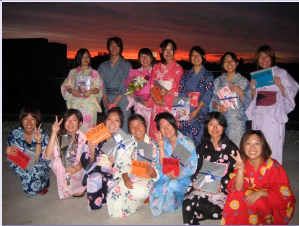
Kyoto Tachibana University students