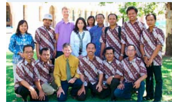
Program participants, Great Court UQ St Lucia campus

The program was facilitated through IDP Education Australia's Malang, Indonesia, office with program funding provided by the Indonesian Directorate General of Higher Education (DIKTI) Overseas Postgraduate Scholarship Program (PBPLN), developed to support Indonesian university lecturers to undertake postgraduate research activities.