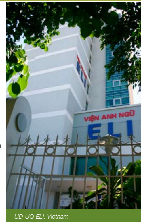
UD-UQ ELI, Vietnam

The ELI has also recently established an alumni network to enable its students to maintain the friendships and important connections made during their time at the Institute and to remain informed as to the ELI's growing range of high quality English language training and testing services. For more information on the UD-UQ ELI visit: www.elidanang.edu.vn