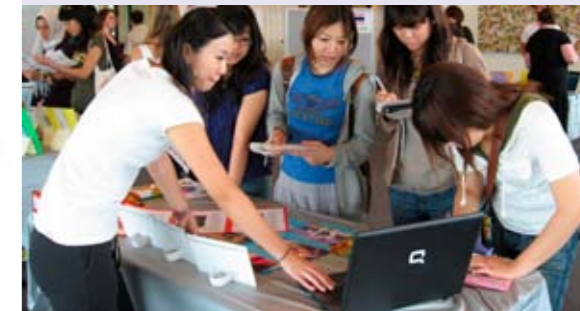
ESP:T&H Tourism Expo

For more information on ESP:T&H visit: www.icte.uq.edu.au/englishcourses/tourismandhospitality.htm